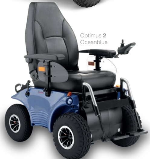
Optimus 2 Oceanblue