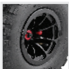
Black aluminium rims