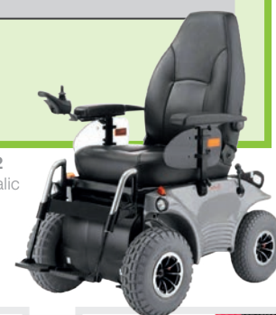
Optimus 2 Silvermetallic

RS Edition: Includes Black Chassis & Rims, Black/Red ErgoSeat padding & Calf Strap, Red Calf Strap retainer, lever for central release & drum brake & rear marking tape signal. The Optimus 2 RS is ISO Crash Tested.