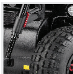
Excellent traction and off-road handling